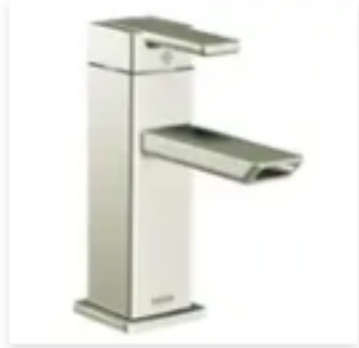
Single Hole Faucets