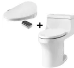
Toilets with Bidet Seats