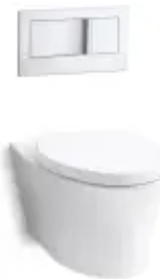
Wall Hung Toilets