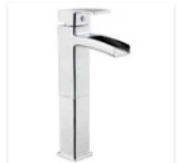
Vessel Sink Faucets