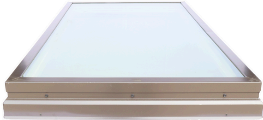
2852 FLAT GLASS LOWE/CLEAR BRONZE CURB MOUNT UNIT 22 1/4x 46 1/4 net inside frame SKU 0900048