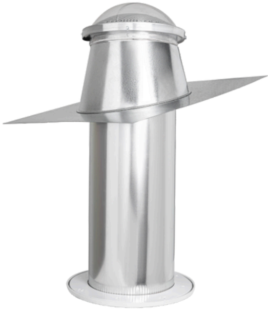
SKYVIEW TUBE KIT 8" SKU 0900033 12" SKU 0900034