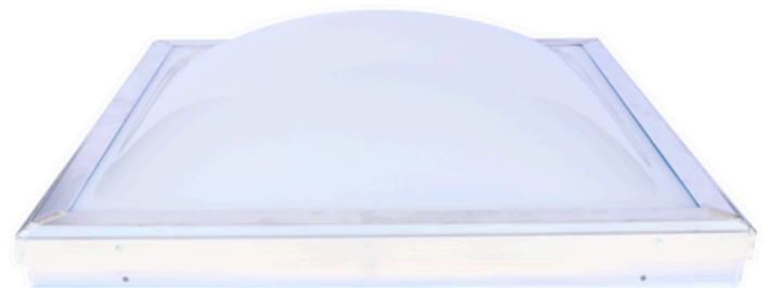
2828 DD WHITE/CLR MILL CURB MOUNT UNIT 22 1/4x 22 1/4 net inside frame SKU 0900041