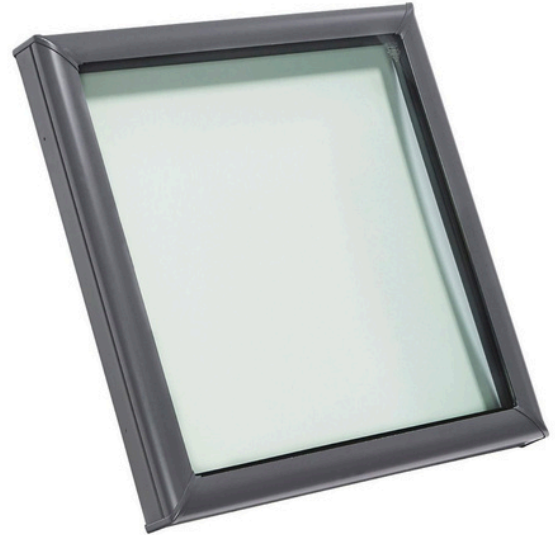
VELUX FCM 2222 0005 LOW-E3 CLEAR TEMPERED INSULATED 22-1/2 X 22-1/2 INSIDE DIMENSION SKU 0900073