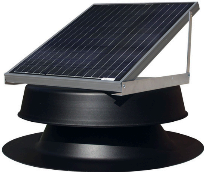
SAF32RMADJ 32 WATT ATTIC FAN BLACK ROOF MOUNT ADJ PANEL SKU 0800089