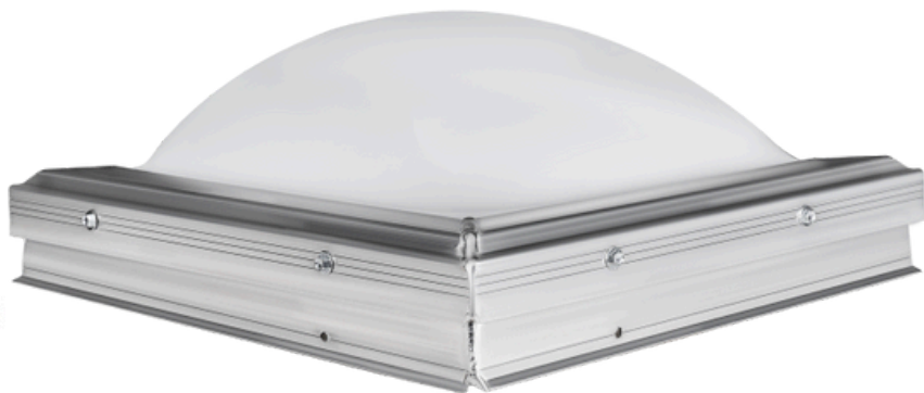
2852 DD WHITE/CLR MILL CURB MOUNT UNIT 22 1/4x 46 1/4 net inside frame SKU 0900044