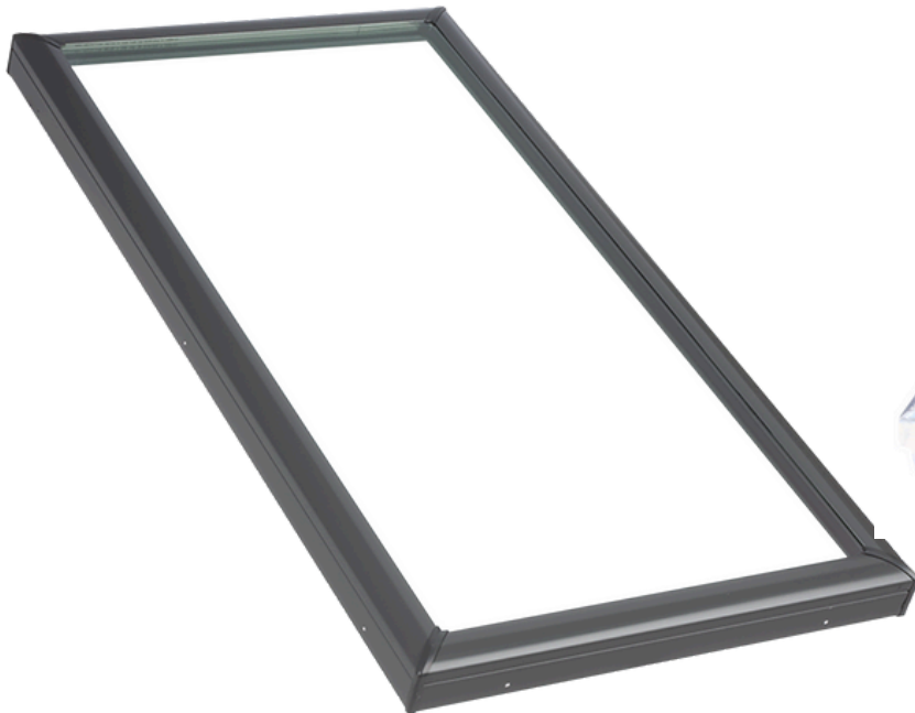
VELUX FCM 2246 0005 LOW- E3 CLEAR TEMPERED INSULATED 22-1/2 X 46-1/2 INSIDE DIM. SKU 0900074